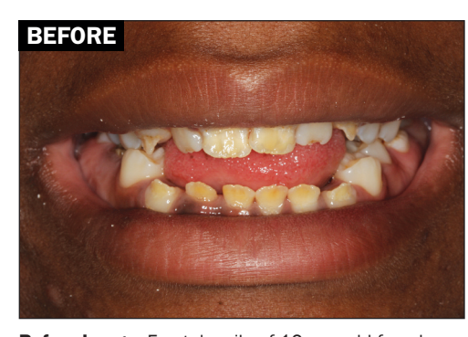
Before Image. Frontal smile of 12-year-old female with amelogenesis imperfecta.

Patients presenting with severe hypomature or hypocalcified AI may require crowns at an early age to prevent pain that can be associated with chewing and the thermal sensitivity this disease presents.