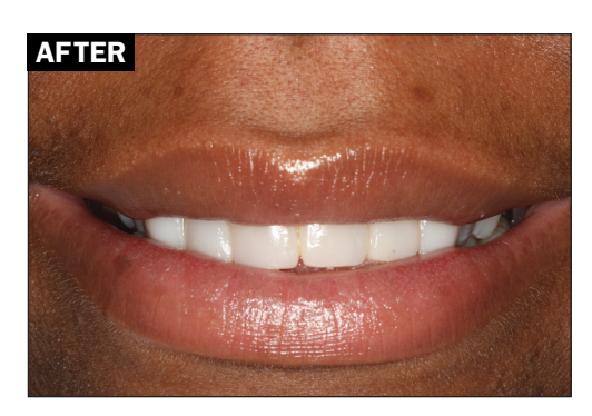
After Image. Natural smile; after composite resin rehabilitation

The incidence of skeletal open bites has been reported in 25% to 35% of patients with AI. While it is unclear why this associ-