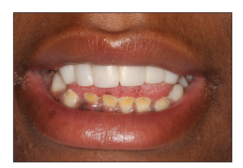
Figure 12. Completed maxillary teeth.