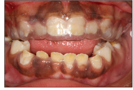
Figure 3. Stent of the mock-up use for intraoral evaluation.

Once the remaining enamel was exposed and the biologic width protected, the enamel was roughened both buccally and lingually with use of a gin-