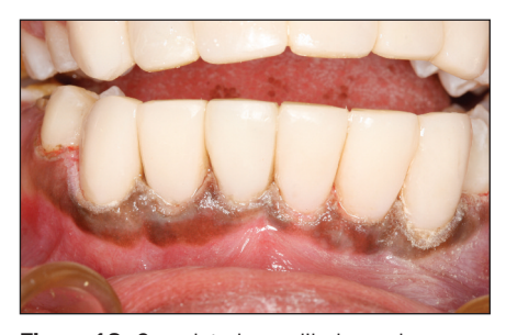
Figure 18. Completed mandibular arch.