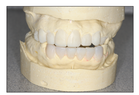
Figure 2. Direct composite resin mock-up to approximate contours.

Wright J. The diagnosis and treatment of dentinogenesis imperfecta and amelogenesis imperfecta. Hellenic Dent J. 1993;2:17-24.