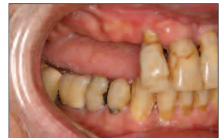
Figure 14. Right lateral view shows extensive bone loss secondary to chronic periodontitis.