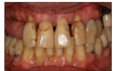
Figure 13. Case 3: Generalized severe periodontitis frontal view. The patient is undergoing segmental full mouth rehabilitation.