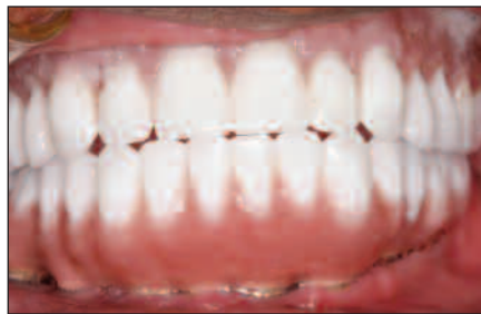
Figure 9. The completed, delivered mandibular fixed restoration. Lingualized occlusion with the interim upper denture can be visualized.