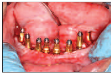
Figure 6. Nine implants (BioHorizons) were placed with an optimal A-P spread in the grafted mandibular arch to provide for sufficient support for a cemented hybrid restoration.

In Figure 9, one can observe the upper denture opposing the mandibular cemented bridge which allowed our patient's diet to improve substantially. The patient's wife has reported needing "a second job to pay the food