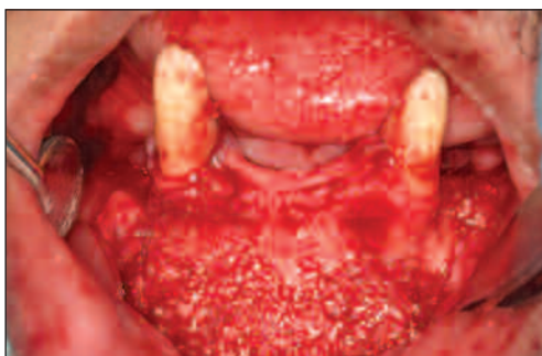
Figure 5. The defect is filled in with a combination of demineralized and mineralized freeze dried bone mixed with plasma rich proteins to allow the defect to fill in more rapidly.