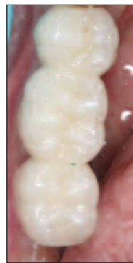
Figure 19. The segmental rehabilitation continued with placement of 3 implants in the patient's lower right quadrant to remove loose and painful teeth.

The completed bridgework, as seen in Figures 17 and 18, shows the 3-piece porcelain-fused-to-gold restorations which have been created with dovetails at the distals of each canine. The use of Tatum implants and their abutments ( prepared intraorally ) have helped to keep the costs of this case within reach for the patient. Laboratory bills can escalate quickly when we include custom abutments, soft-tissue models, custom anterior guide tables, high noble gold, pink porcelain fabrication, model work, implant components, custom milling, etc. So, we must evaluate costs of not only surgical sides of treatment, but the costs of the prosthesis, profit needs, and overhead expenses. Then, we can make choices with regard to abutment selection, prosthesis type,