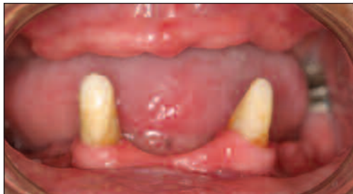
Figure 1. Case 1: A patient who has been wearing an upper denture and lower partial for more than 10 years. He has altered passive eruption of the canines, c-h bone in the mandibular anterior and posterior segments.

Patients want teeth. They all have egos, fears, financial worries, and preconceptions.