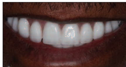
Figure 10. Smile line display of upper denture with the cemented lower hybrid restoration.

ills now!" (There are openings for supperflous to pass under the bridge.)