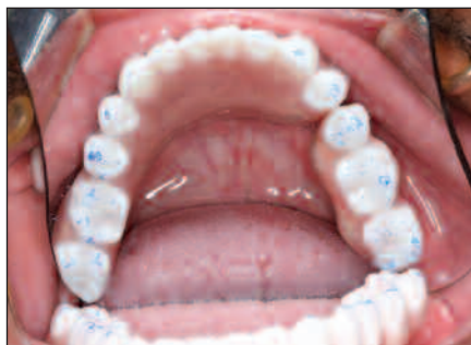
Figure 8. The occlusal view of the finished hybrid prosthesis demonstrating the lingualized occlusion and a break at the mental foramen. Splinting a complete lower arch would not allow for mandibular torsion/flexion, so a full prosthesis needs to be separated at one of the mental foramina.