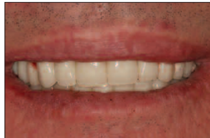
Figure 12. Case 2: The delivered temporary restorations (BioTemps [Glidewell Dental Laboratories]) placed at the time of implant surgery and partial edentulation.