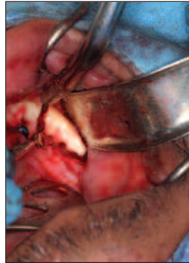
Figure 2. Harvest of the ramus was accomplished as part of an overall rehabilitation plan to augment the patient's mandible and maxilla.

treatment dollars available, and how they are allocated between the specialist and the referring dentist. Any of these topics could be elaborated upon in great detail, and that is why lectures, continuing education centers, books, Internet courses, etc, are all a part of acquiring this information.