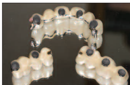
Figure 18. View of fixed bridgework in 3 pieces with 2 dovetails. This design may aid in retrievability. (Note: There was sufficient retention that allowed us to break the prosthesis up.)

The completed bridgework, as seen in Figures 17 and 18, shows the 3-piece porcelain-fused-to-gold restorations which have been created with dovetails at the distals of each canine. The use of Tatum implants and their abutments ( prepared intraorally ) have helped to keep the costs of this case within reach for the patient. Laboratory bills can escalate quickly when we include custom abutments, soft-tissue models, custom anterior guide tables, high noble gold, pink porcelain fabrication, model work, implant components, custom milling, etc. So, we must evaluate costs of not only surgical sides of treatment, but the costs of the prosthesis, profit needs, and overhead expenses. Then, we can make choices with regard to abutment selection, prosthesis type,