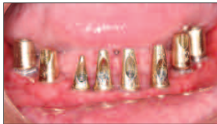
Figure 7. Abutments (Atlantis) were fabricated and cast to allow for more prosthesis support than standard abutments would have provided.