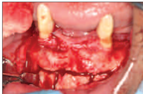
Figure 4. Outline form for the graft, avoids mental nerve involvement, and maximizes the harvest of autogenous bone—the gold standard for ridge augmentation.