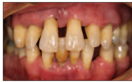
Figure 11. Case 2: The patient presented with severe periodontal disease necessitating full edentulation with fixed implant restorations in both arches. Several teeth were maintained for long-term abutments for provisionalization.

We see the final smile (Figure 10) of the upper denture opposing the implant restoration. This denture is covering a grafted maxilla which has 9 implants awaiting uncover and a