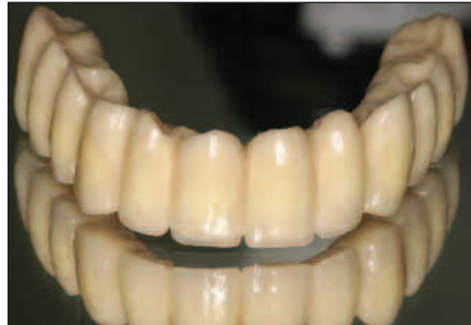
Figure 16. Laboratory fabricated temporary restoration (Biotemps) for placement at first surgery.

implant bridge. It should be noted that this patient had planned financially and accepted treatment for full-mouth rehabilitation, and thus far, has completed his maxillary and mandibular right restoration.