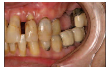
Figure 15. Left lateral view of patient demonstrates tooth loss, cross bite, and spacing as a result of increased mobility of all teeth.