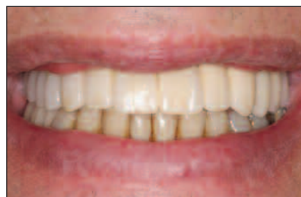
Figure 21. Completed maxillary and mandibular right reconstruction. The crown height has been corrected to change the prosthesis from FP-3 (long teeth with excess porcelain), to FP-1 normal tooth sizing. This patient was able to reverse time aesthetically.