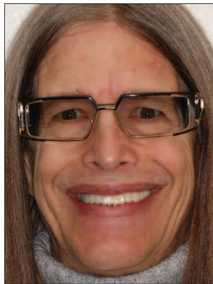
Figure 20. Final smile of implant supported bridges.

In Figure 19 we see the 3-implant-supported bridge in the patient lower right quadrant. It is of note that implant crowns should have a narrower occlusal table to decrease force factors on the prosthesis. In addition, they should have flatter occlusal mor-