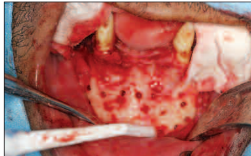
Figure 3. Outline of the donor site for symphysis grafting was performed so that sufficient bone could be grafted to allow for fixed, "FP-3" teeth.

It is up to us to try and help patients achieve their goals. Implant dentistry can be difficult for dentists to become involved in for several definitive reasons. First, doctors may not fully understand the options available, treatment planning, bone height and width requirements, or the surgical costs involved. Second, dentists may not understand all of the steps needed, or what is involved from a fee standpoint, in order to competently complete the case. Third, they are often at the mercy of the referring specialist as to the type of implant system used, the overall