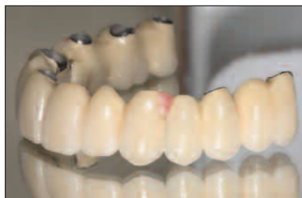
Figure 17. Final fixed restoration FP2. Incisal edge position, aesthetics, phonetics, and function were evaluated with the provisional prosthesis.