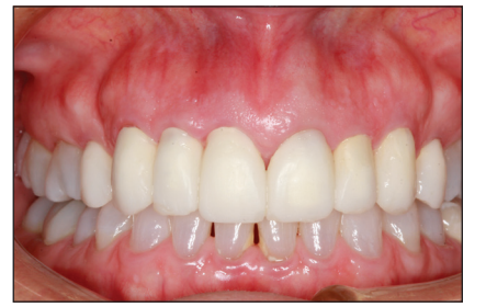
Figure 13. The provisionals, prior to staining and glazing.