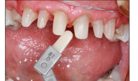
Figure 9. The stumpf (stump) shade of preparations.

Figure 8b. The sequential bite registration (Blu-Mousse).