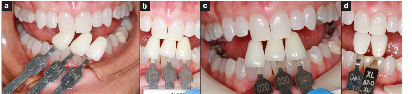
Figures 6a to 6d. Shade tab photos for the lab.