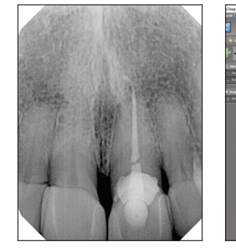
Figure 21. The 3-year postop periapical radiograph, taken after repair of resorption and restoration.