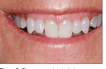
Figure 2. The pre-op retracted view.