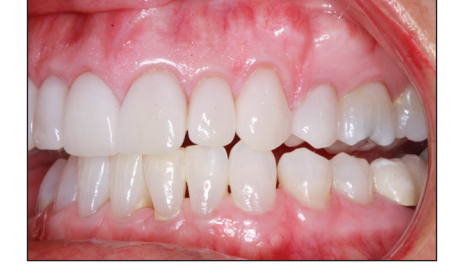
Figure 20. The canine guidance left at 3 years post-op.