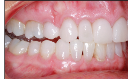
Figure 19. The canine guidance right at 3 years post-op.

Whether this case would have been restored with a single tooth implant or the way it was restored with endodontic treatment, an external cervical resorption (ECR) restoration and traditional crowns depend on training, skill, philosophy, and judgment. However, when also considering the patient's aesthetic desires, the solutions become more patient centered. Now, if the central incisor fails, the shade of the teeth has already been documented and recorded, and a custom porcelain shade tab was fabricated and preserved to mimic her most difficult porcelain shade. The emergence angle and profile of tooth No. 9 is a positive emergence angle and