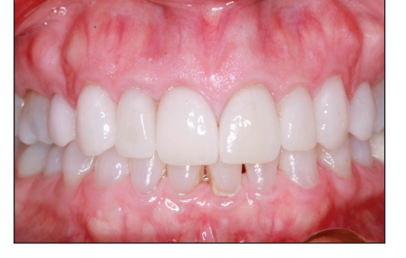
Figure 16. A 3-year postoperative photo of the lithium disilicate (IPS e.max) restorations.

Carefully fabricated provisionals allowed for custom anterior guide tables to recreate proper lingual contours in the approved provisionals and the final restorations. The use of a double-cord technique, a quality vinyl polysiloxane (VPS) material (Aquasil