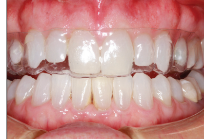
Figure 7. A clear pull-down matrix was made from the diagnostic wax-up and is shown here over the teeth.